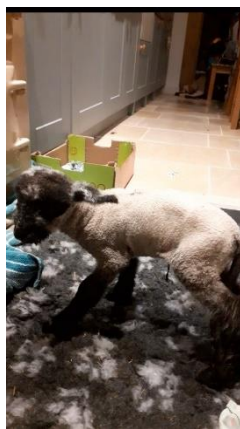
Little Dude when he was only a few hours old He was so tiny and poorly.